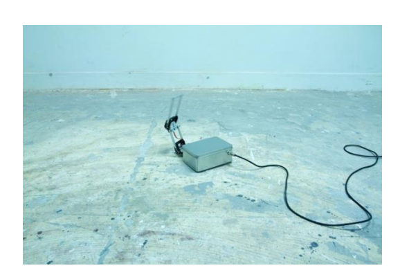
Fig. 1 I'm evolving into a box., 2017, Wei-Yu Chen, Copyright © 2017 Wei-Yu Chen All rights reserved.

hypothesis about AI. [1] Therefore, I try to demonstrate this subtle status in my work. When I created this work, I was wondering what would happen if an artificial intelligence algorithm was installed into a lifeless object? After simulating what it would look like, the answer was unimaginable, and that is why the algorithm works. The end result was that I combined an iron box and a machine learning algorithm: training a box to act like a box (Fig. 1)