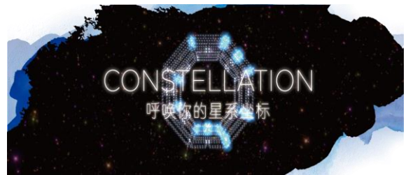
Fig 1. Title picture and marketing material of Constellation-Call Your Personalized Constellation , 2018, Nan Zhao, digital/print, Creative Commons Attribution-NonCommercial-ShareAlike 2.0 Generic license

To experience the journey, you first type in your name and birthday to see the initial star positions. Then you input your voice by reading a poem. The voice information will be recognized with voice recognition API. All the personal information is further converted into a systematic, personalized constellation through WebGL technology, generative art algorithms, and BAGUA philosophy. You will see how your personal information generates a constellation system, step by step, through the well-designed user experience journey. Entirely different from those static twelve existing constellations in the world, this constellation is dynamite and feels alive.