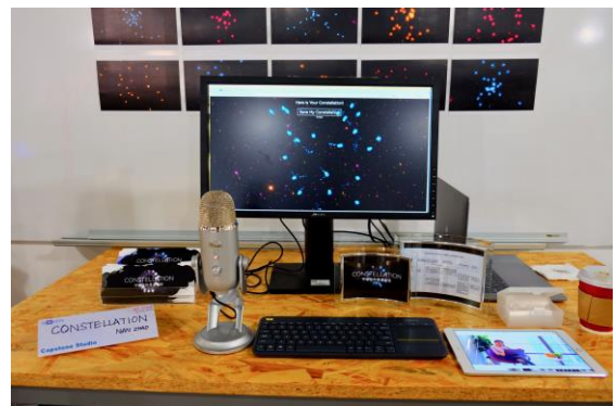
Fig 2-3. Photos of an exhibition and people experiencing Constellation-Call Your Personalized Constellation , 2018, Nan